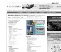
Bonus: Medium Rectangle Online Ad

BONUS: Receive 1 year FREE medium rectangle ad on Directory.BiodieselMagazine.com with the purchase of a display ad.